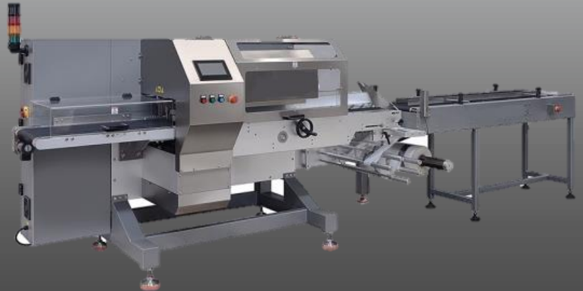
Film feeding from the bottom